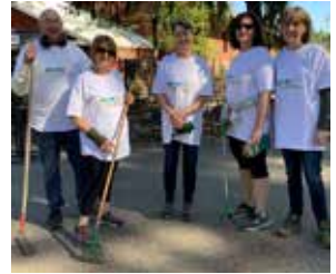
Our outreach committee performed its first community project, assisting with the clean up and restoration of the beautiful Nevada County Fairgrounds.

The critical need for skilled workforce within the community is being assisted by the Talent Development Committee, an initiative of NCERC. This diverse group of committee members and others within the community are working with schools, businesses, and employment agencies to find ways to bring qualified skilled workforce to our community.